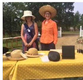
The Hat Stall