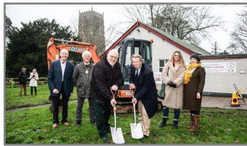
Cutting the first sod